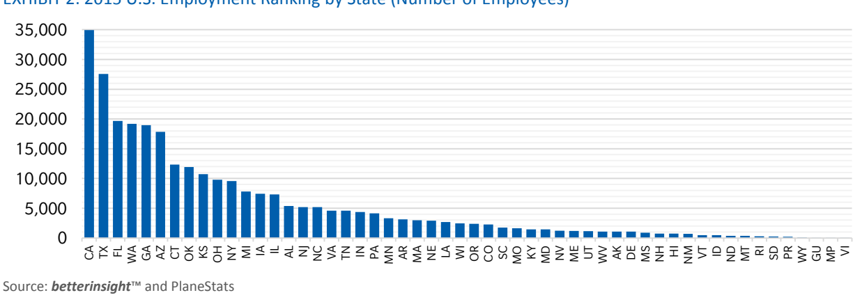
EXHIBIT 2: 2015 U.S. Employment Ranking by State (Number of Employees)

Analyzing the MRO industry at the state level, CAVOK estimates that California, Florida, Georgia, and Texas combined represent 35.0% of the total US civil aviation maintenance employment with an estimated 101,147 employees; the top ten states represent 63.2% of the total employment in the US.